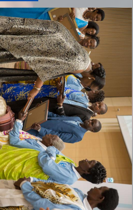
National Unity and Reconciliation Commission of Rwanda (United religious Initiative, 2020)

Training leaders and facilitating collaboration towards one common goal. Facilitation allows stakeholders to develop their own opinions.