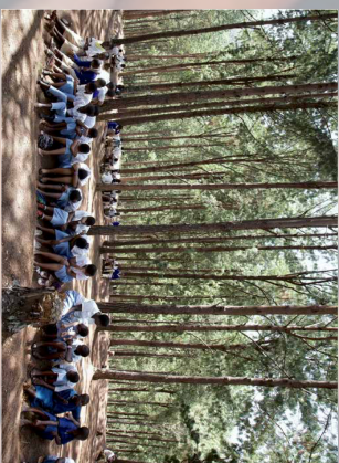
Students take time to reflect on their country's past during a commemoration for teachers killed during the genocide.